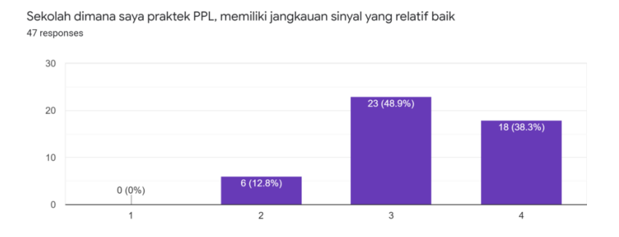
Figure 3 Quality of internet Signal

To portray the quality of internet signals, the researchers illustrated them in the figure 3 below: