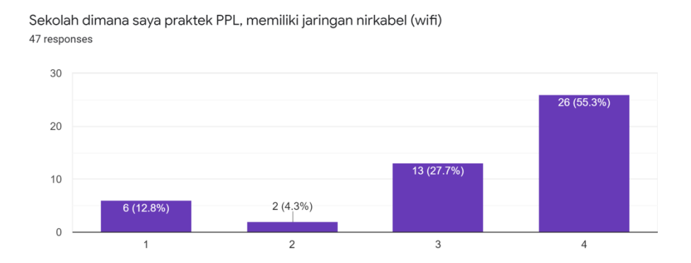
Figure 2 The Availability of Internet device (wi-fi)

In order to answer the first research question, the researchers used four Likert-scales consisted of Strongly Agree (score 4), Agree (score 3), Disagree (score 2) and Strongly Disagree (score 1). The information received from the respondents was presented in the following figure: